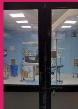
WALLS , FLOOR AND BMW BINS CLEANING IN OPERATING ROOM