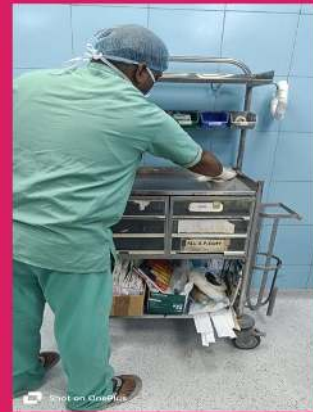
EQUIPMENT CLEANING IN OPERATING ROOM