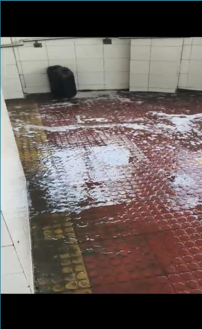
Cleanliness drive in Ramp and Terrace Area CNBC