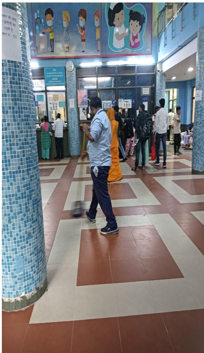
Cleanliness drive in OPD Area CNBC