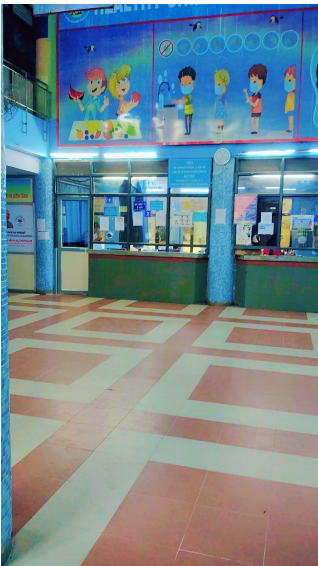
Cleanliness drive in OPD Area CNBC