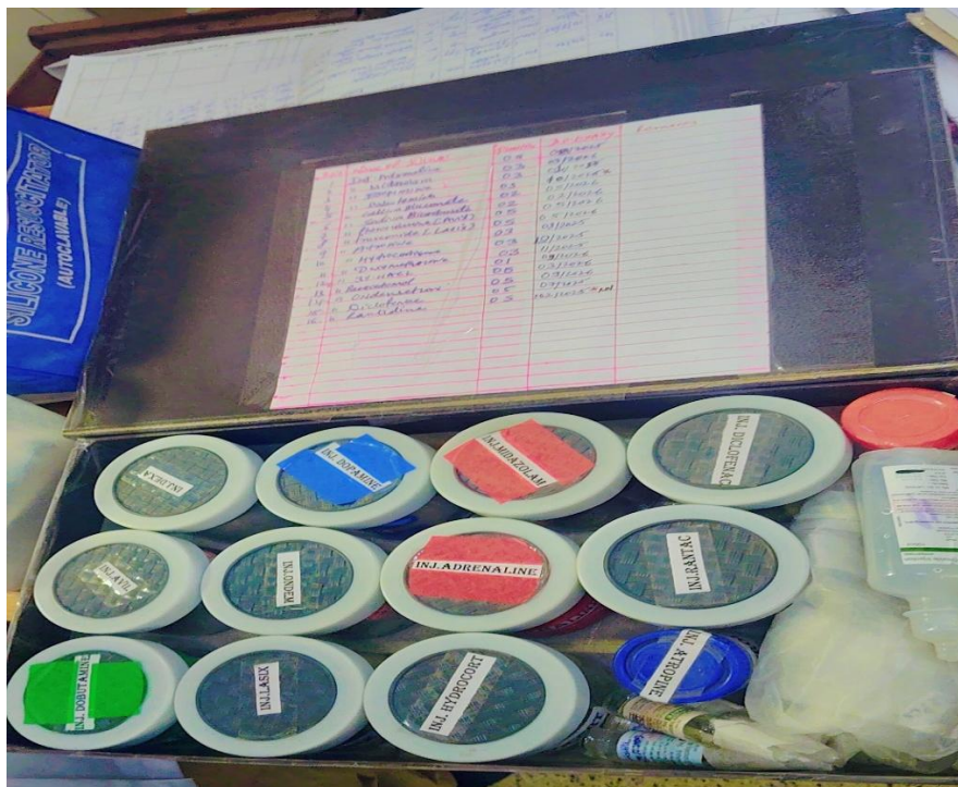
Ambulance Emergency Drugs